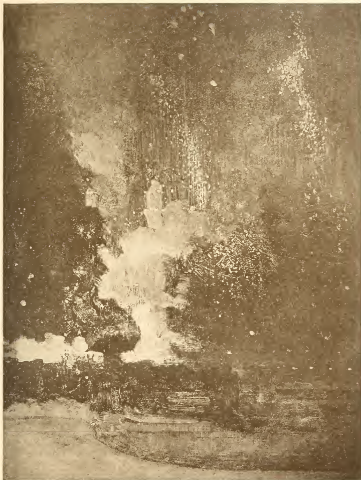
Nocturne in Black and Gold. THE FALLING ROCKET.